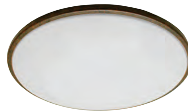
BRUSHED RUST †