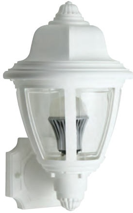
31291 CLEAR | WHITE