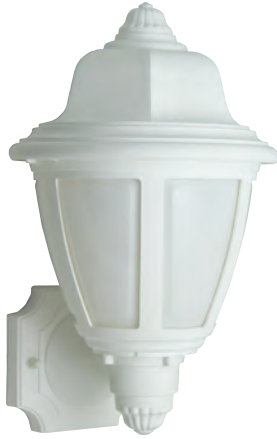
31211 WHITE | WHITE