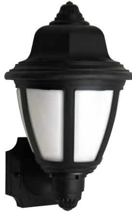
31215 WHITE | BLACK