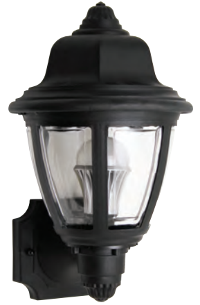
31295 CLEAR | BLACK