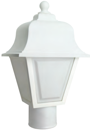
86111 WHITE | WHITE