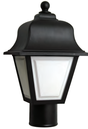
86115 WHITE | BLACK