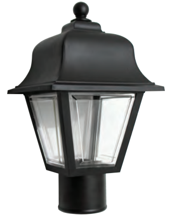
86195 CLEAR | BLACK