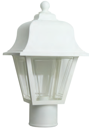
86191 CLEAR | WHITE