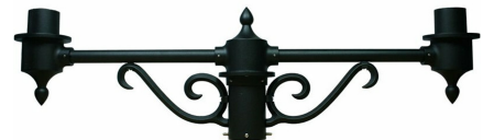
PADAB - Double Post Top ( sold separately )