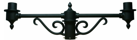
PADAB - Double Post Top ( sold separately )