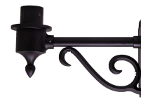
PWASAB - Wall Bracket ( sold separately )