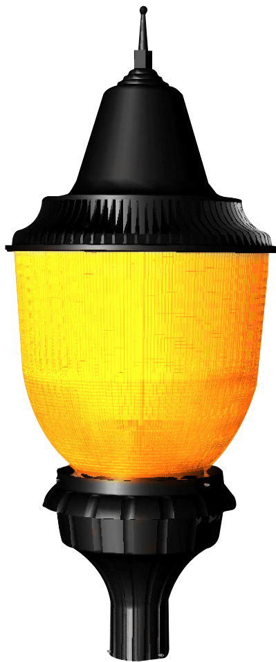
Shown with Spear Finial