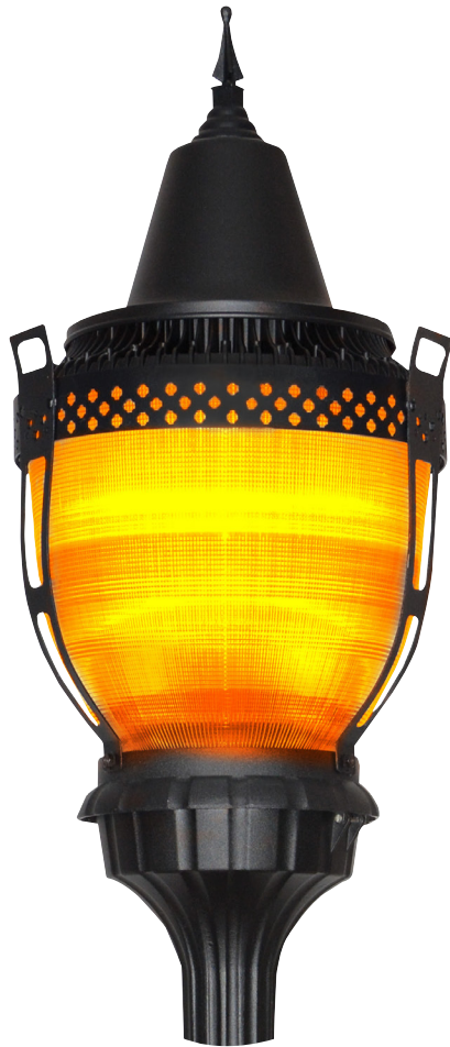
Shown with Spear Finial