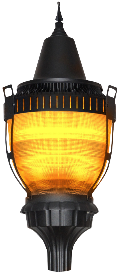
Shown with Spear Finial